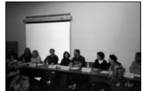
Experienced Adoptive Parents & Adoptees Panel at December 7th "Tips for Parenting" training

2025 Sheridan Avenue, North Bend, Oregon 97459